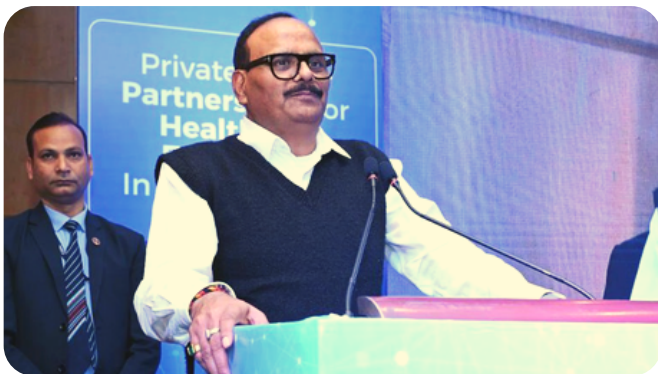
Shri Brajesh Pathak Honourable Deputy Chief Minister, Medical Health & Family Welfare