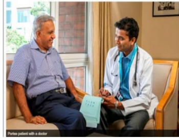
Patient patient with a doctor

The decision will result in an increase in spending for the government from Rs 240 crore to Rs 300 crore By JOEL MATHEW, Apr 3, 2022 | 3 min read The decision will result in an increase in spending for the government from Rs 240 crore to Rs 300 crore. The decision will result in an increase in spending for the government from Rs 240 crore to Rs 300 crore. The decision will result in an increase in spending for the government from Rs 240 crore to Rs 300 crore.