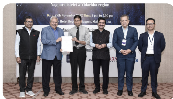
MoU signed between NATHEALTH and Vidarbha Hospitals Association

at least 76 new primary healthcare centers (PHCs), while increasing staffing in existing ones.