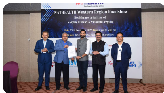
MoU signed between NATHEALTH & Shalinitai Meghe Hospital & College

Coming to the recent decades, there is a positive upward trend in healthcare expenditure. Insured schemes for healthcare have increased in number and effectivity. There is a speculation that unified