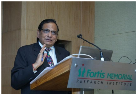
Dr Vinod Paul, NITI AAYOG