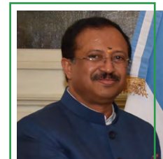
V. MURALEEDHARAN Hon'ble Minister of State for External Affairs, Government of India