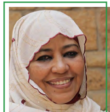
H.E. AMIRA ELFADIL Commissioner for Social Affairs, Africa Union Commission